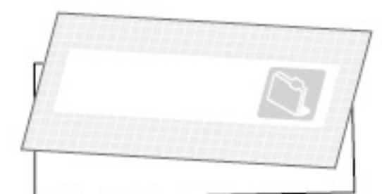
5 index sheet / card

Steel parts cabinets ST Hang Bins HB Mobile cleartrp out bins FO/MS Tool Boxes TB CNC Tool Carts TW Ultra Heavy duty Carts CT Workbenches WB Anti Static Organiser ESD Office Filing Cabinets OA Combination total office solutions SOHO File Organisers DD/O/F/K/D/SB