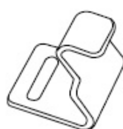
2 fixed clip